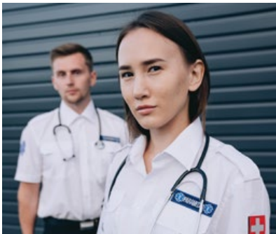
Faster Medical Assistance